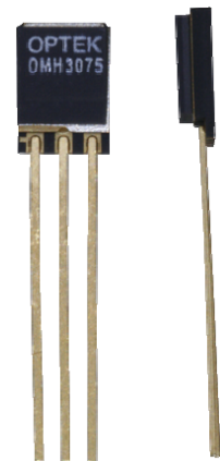
OMH3075 Bipolar Hall Effect Sensor